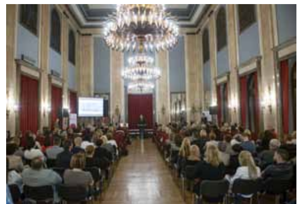
Opening ceremony, Belgrade City Hall