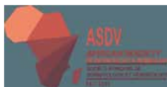
African Society of Dermatology and Venerology